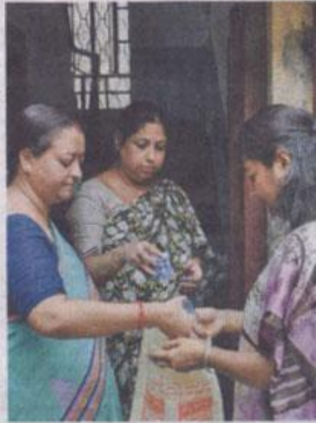
Members of Milk Club distribute milk packets to underprivileged families in Howrah and (right) members donate money towards the club funds every month.